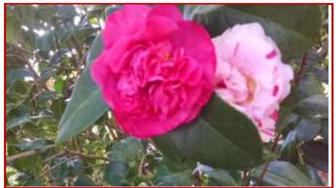
Sport at Bok Tower Gardens

who signed up at our show. We look forward to meeting you and sharing our love of camellias!