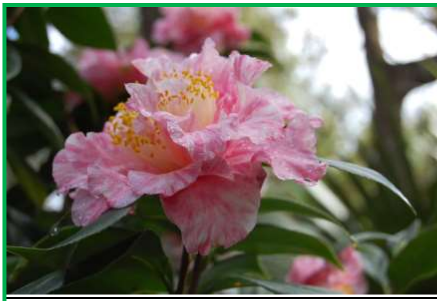
Camellia photo, courtesy of Jill Reed:

MONDAY, January 6- Farewell Breakfast in the Convention Center